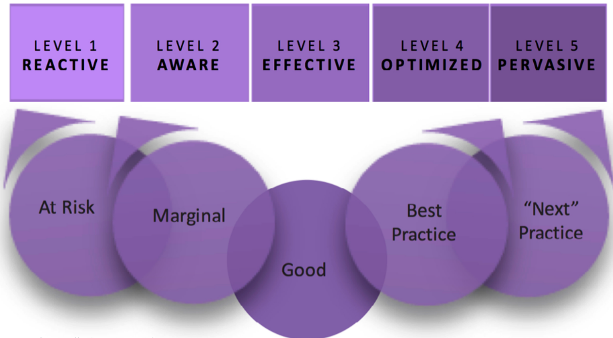
Figure 3. How Digital Performance Management Can Supercharge Customer Experience

The maturity matrix for digital performance provides brands with a way to assess how their business is faring with best practices. Each level of the matrix has risk factors as the digital experience is optimized for customers. The matrix also associates performance metrics with business requirements that are necessary to succeed in creating superior customer