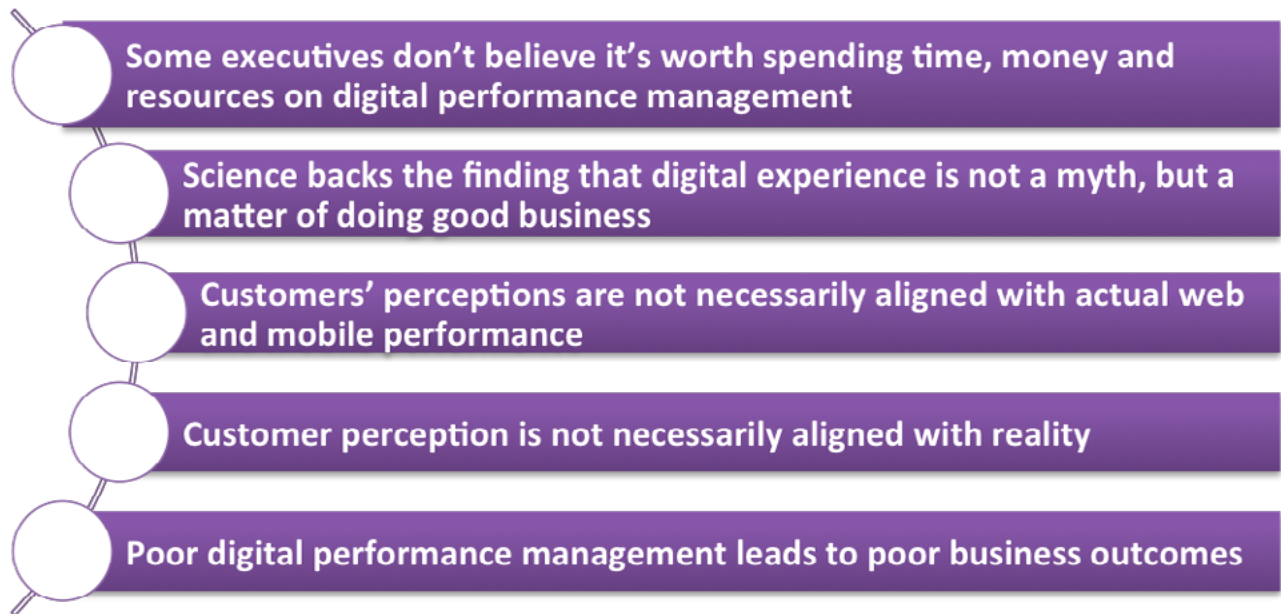
Figure 1. Digital Performance Management Is Not Necessarily a Top Priority Yet